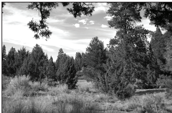
Junipers near Paisley, Oregon

have emerged when landowners, “on the ground” agency staff, local government and citizens come together to solve a common problem. The Deschutes River Basin project and its water bank are one of the most frequently cited examples of compromise and positive problem solving to achieve adequate clean water for agriculture, fish and the City of Bend.