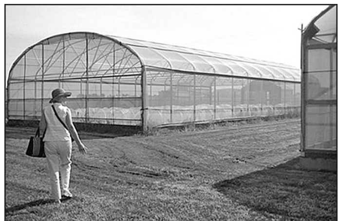
OSU Extension Station, Pendleton, Oregon

Despite Oregon’s reputation for rain, nearly 45% of Oregon’s farms and ranches use some form of irrigation. Indeed, approximately 70 to 87% of water from rivers, streams and ground sources in Oregon is used for agricultural irrigation. 42