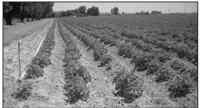
Klamath Falls, Oregon

The principle of “first in time-first in right,” called prior appropriation, has been the basis for Oregon water use law since 1909. This approach originally only applied to surface water. The fundamental doctrine has evolved over time. The first person granted a water right has priority over all later rights and is entitled to use that full right in times of shortage before all others may use theirs. Water rights under prior appropriation are tied to the land and specify amounts, type of use and point of diversion. Regulations specify that the use must be beneficial without waste. “Waste” is not legally defined. In 1955, water law expanded to include groundwater, and by 1987 water rights had evolved to include in-stream uses and to allow the right holder to transfer point of diversion, timing and type of use.