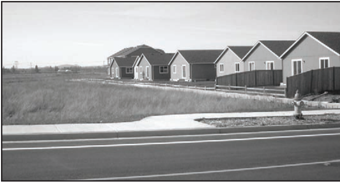
Newer subdivision, West Eugene