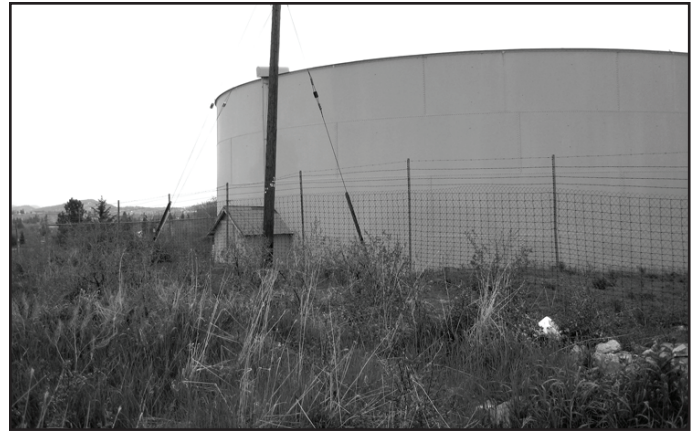
Water tank above Klamath Falls

Plan requires that companies and other property owners conduct some restoration of the riverbank, or pay into a fund that can acquire and restore land in the same area. This is to mitigate for their impact to water quality and habitat. The Plan provides some baseline regulatory requirements to make improvements over time for an area that is highly impacted by industry... By approving this plan, a modest charge is assessed to businesses seeking to expand their operations along the river, and these funds will assist restoration efforts. 54