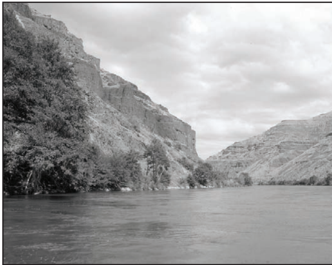
Lower Deschutes River

Legislators recognized this problem and amended prior appropriation laws to create in-stream water rights to protect the flow for fish; however, these rights are junior to many existing rights. The creation of water lease transfers allows for both short and long term conservation leases. But, convincing those holding old water rights to use conservation leases is difficult because they fear that they might not have the water they need in the future. Interviewees noted that very little has been changed since 1987 when the in-stream rights were enacted. Most streams remain over-allocated and result in low flows in the summer and early fall during the period of highest demand.