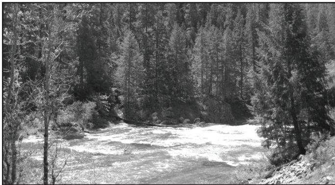
North Umpqua River

According to the Associated Oregon Loggers, “Water is indeed a forest product. Most municipal water originates in forests, and in the West, almost 70% of useable water comes from managed forests -- many such forests where harvest occurs.” 65 In contrast, in Oregon, 80% of the water supply source is forest land. 66 This is where water quality and quantity issues begin.